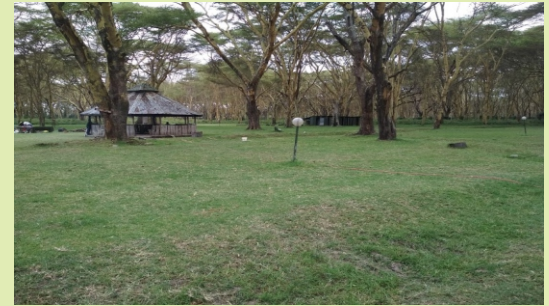
Camping and events grounds