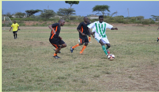
Soccer pitch/track field