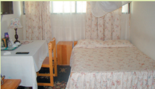
Guest rooms with DSTV & Internet